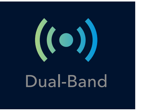
Wi-Fi 6 - The Most Powerful Wi-Fi Ever